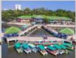
Muttukadu Boat House