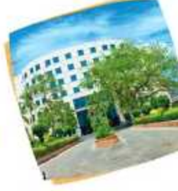
Hindustan Institute of Technology & Science