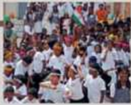
Gurukulam Children's Trust