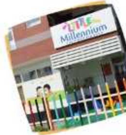
Little Millenium Pre-school Padur