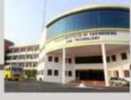
Balaji Institute of Engineering and Technology