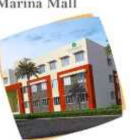
Velammal New Gen Schol Kelambakkam