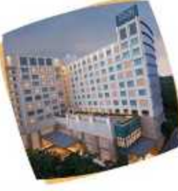
Four Points by Sheraton