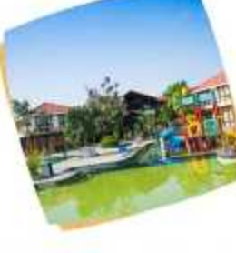
Esthell Village Resort