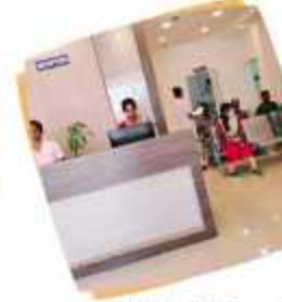
Alpha Multispeciality Hospital