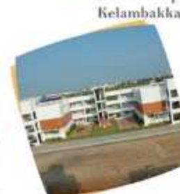
Sri Chaitanya School Chennai