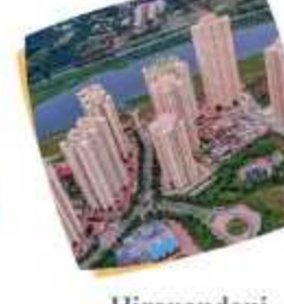
Hiranandani Bridgewood Apartment