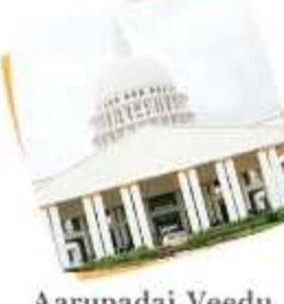
Aarupadai Veedu Institute of Technology