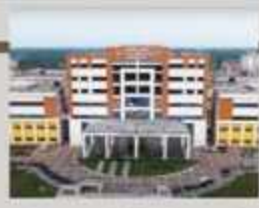
Jagannath College of Nursing