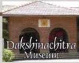
Dakshinachitra Heritage Museum