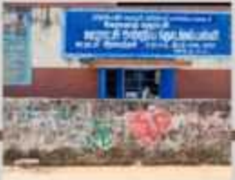
Government Primary School