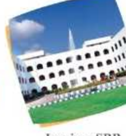
Jeppiaar SRR Engineering college