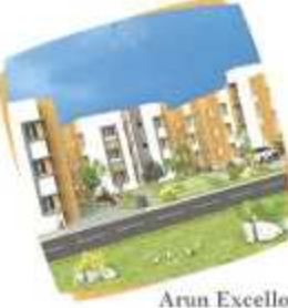
Arun Exello Compact Home Chandrika