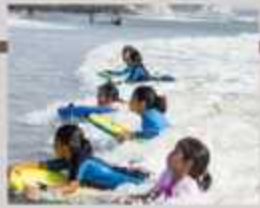
Bay of Life Surf School & Ocean Literacy