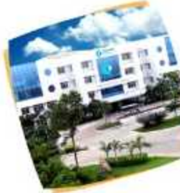
Chettinad Hospital & Research Institute