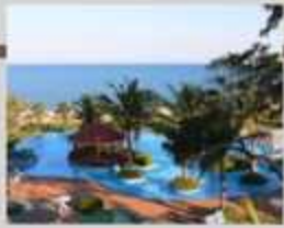
Radisson Blu Bay Resort