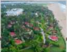
Taj Fisherman Cove Resort & Spa