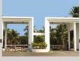
Coral Beach Resort