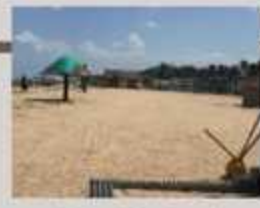
Little GOA Beach Resort