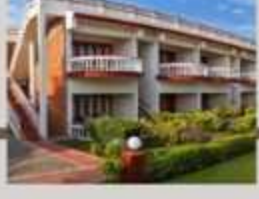
Ideal Beach Resort