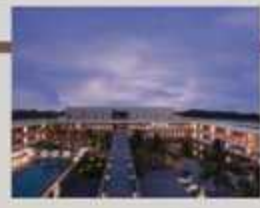
InterContinental Chennai Mahabalipuram Resort