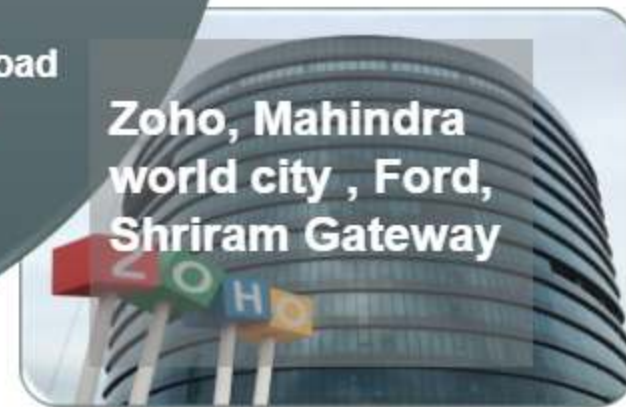
Zoho, Mahindra world city, Ford, Shriram Gateway