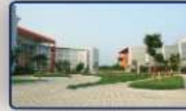
Mahindra World City