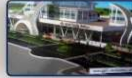
Kilambakkam CMBT Bus Terminus