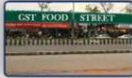
GST Food Street