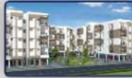
Arun Excello Aparment (Chandrika)