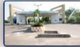
Shri Sathya Sai Medical College & Hospital