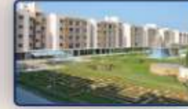
Shriram Sankari Apartment