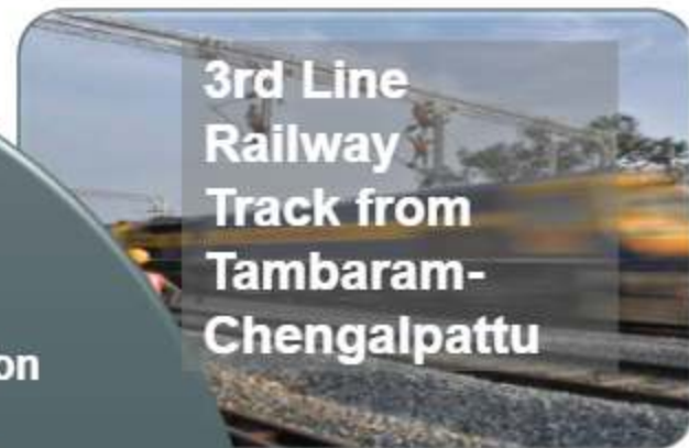
3rd Line Railway Track from Tambaram-Chengalpattu

Proposed Metro Rail Extension from Airport New Bus Terminal (Kilambakkam)