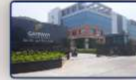
Shriram Gateway (Perungalathur)