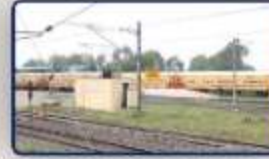
Guduvanchery Railway station