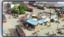
Guduvanchery Bus Stand