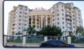
S.I.S Queens Town Apartment