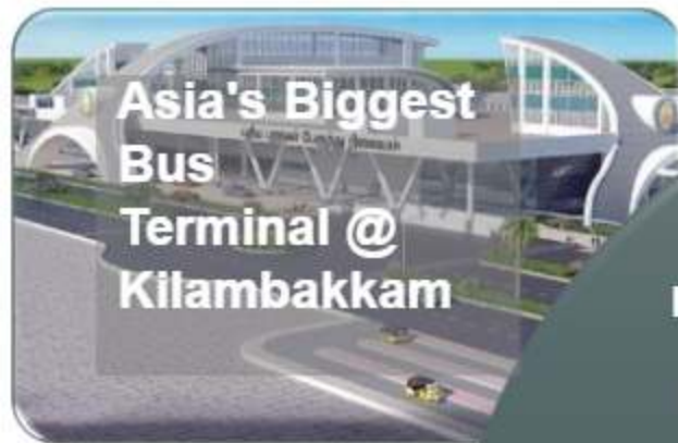
Asia's Biggest Bus Terminal @ Kilambakkam