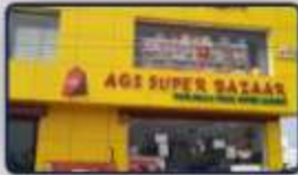
AGS Super Bazaar