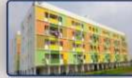
XS Real En Veedu Apartment