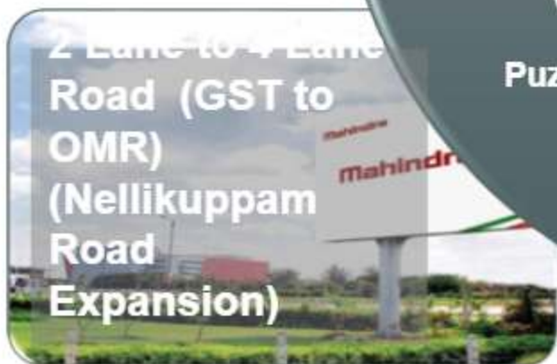
2 Lane to 4 Lane Road (GST to OMR) (Nellikuppam Road Expansion)