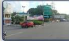
SRM Arts & Science College