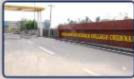
Apollo Arts & Science College