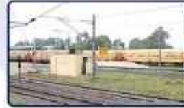
Guduvanchery Railway station