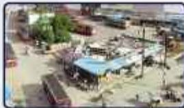
Guduvanchery Bus Stand