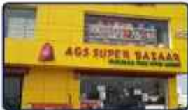
AGS Super Bazaar