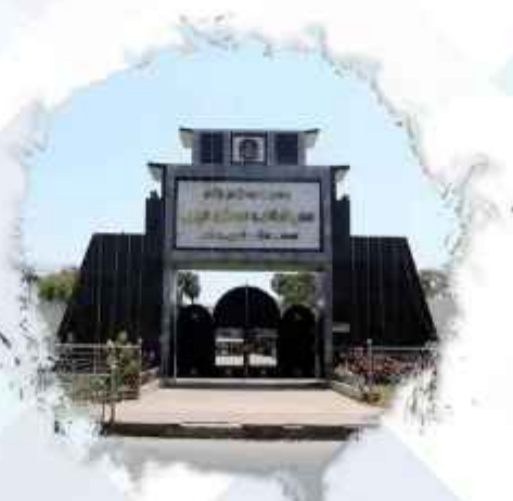
25 MINUTES – VANDALUR