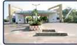
Shri Sathya Sai Medical College & Hospital