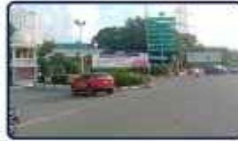
SRM Arts & Science College