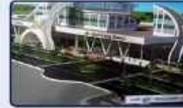
Kilambakkam CMBT Bus Terminus