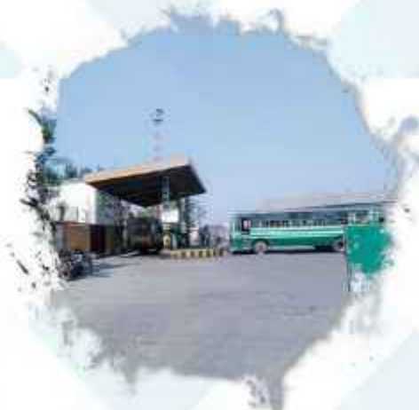
35 MINUTES – CHENGALPATTU