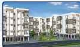
Arun Excello Apartment (Chandrika)