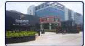
Shriram Gateway (Perungalathur)