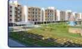
Shriram Sankari Apartment