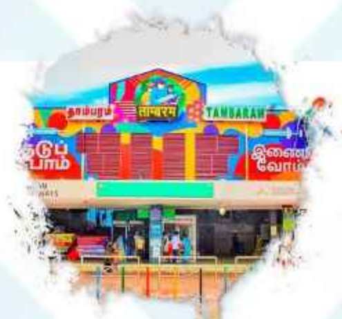
35 MINUTES – TAMBARAM