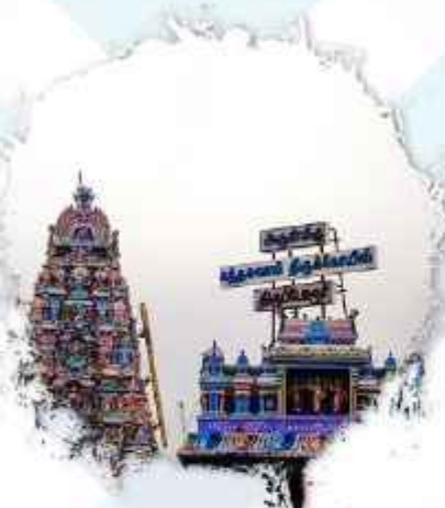
27 MINUTES – THIRUPORUR