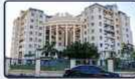
S.I.S Queens Town Apartment