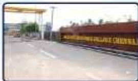
Apollo Arts & Science College