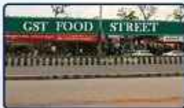
GST Food Street