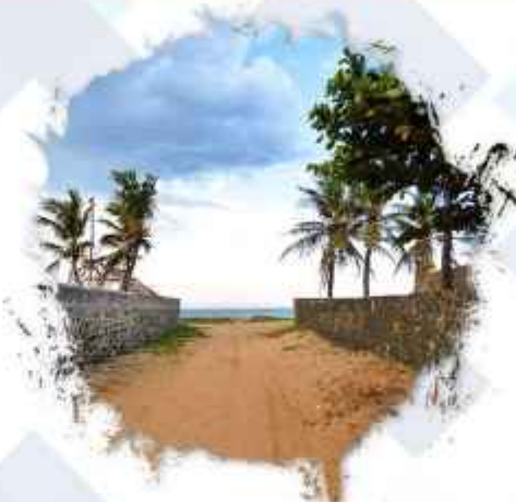
37 MINUTES – ECR