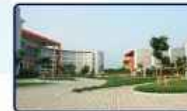
Mahindra World City