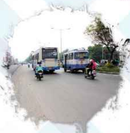
16 MINUTES – GST ROAD