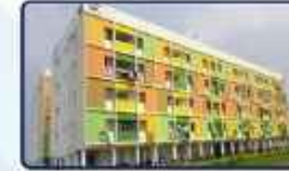
XS Real En Veedu Apartment