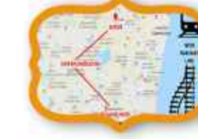
PROPOSED RAILWAY LINE FROM GUDUVANCHERY TO SRIPERUMBUDUR