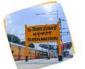
Guduvanchery Railway Station