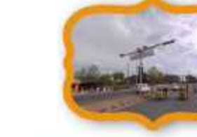
GST ROAD EXTENSION BETWEEN GUDUVANCHERY AND MAHINDRA WORLD CITY