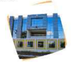
Velammal CBSE School