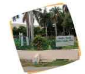
Intimate Fashions India Pvt.Ltd.