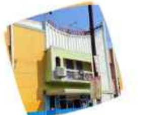
Sri Venkateswara Theatre