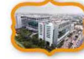
GOOD CONNECTIVITY & DEVELOPED IT PARKS