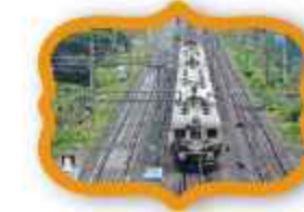
3RD LINE RAILWAY TRACK FROM TAMBARAM CHENGALPATTU