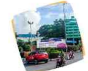
SRM University & Hospital