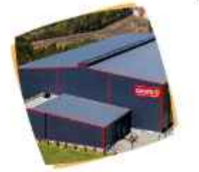
Crown Record Management