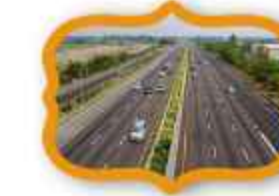
2 LANE TO 4 LANE ROAD (GST TO OMR) (NELLIKUPPAM ROAD EXPANSION)