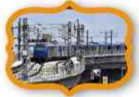
PROPOSED METRO RAIL EXTENSION FROM AIRPORT NEW BUS TERMINAL (KILAMBAKKAM)