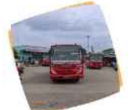
Guduvanchery Bus Stand