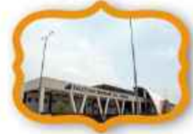
ASIA'S BIGGEST BUS TERMINAL @ KILAMBAKKAM

BE THE PART OF Elite Lifestyle At Prime Location LAKSHMI AVENUE