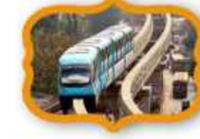
MONORAIL PROJECT (CONNECTING VANDALUR, PUZHAI, VELACHERY)