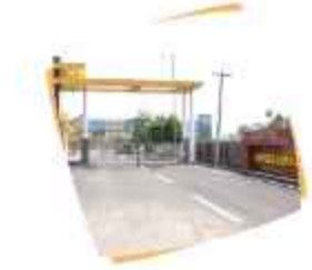
The Apollo College of Arts & Science