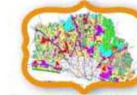
CMDA EXTENSION UPTO CHENGALPATTU DEMAND OF LANDS & INCREASING PRICE