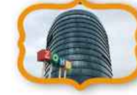
ZOHO, MAHINDRA WORLD CITY, FORD, SHRIRAM GATEWAY