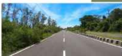
OMR Kelambakkam Bypass

Traffic along Old Mahabalipuram Road is all set to become better with the construction of Thiruporur and Kelambakkam bypasses gaining momentum. Tamilnadu Road Development Corporation (TNRDC) plans to open both roads for public use by the end of this year, OMR, which is a six-lane till Siruseri.