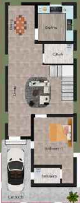
30x52.5' Ground Floor