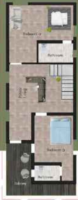
30x52.5' First Floor