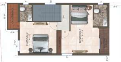
First Floor - 3BHK