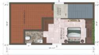
First Floor - 2BHK