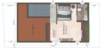
First Floor - 2BHK